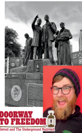
DOORWAY TO FREEDOM Detroit and The Underground Railroad